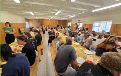
Our senior crew had an epic time staying at Te Ohāki Mārae, tucked under the beautiful Kaimai Ranges.